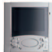
Standard colour: white type 6601 type 660C type 6701