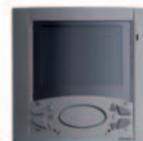
Colour: titanium grey type 6601/37 type 660C/37 type 6701/37