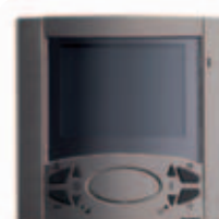
Colour: brushed steel type 6601/40 type 660C/40 type 6701/40