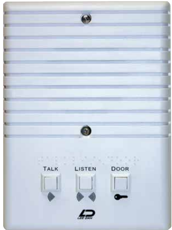
(Model IR-203E, IR-204E, IR-205E shown smaller than actual size)

IR-205E 5 Wires. Use 2 twisted pairs, plus 1 selective #22 gauge.