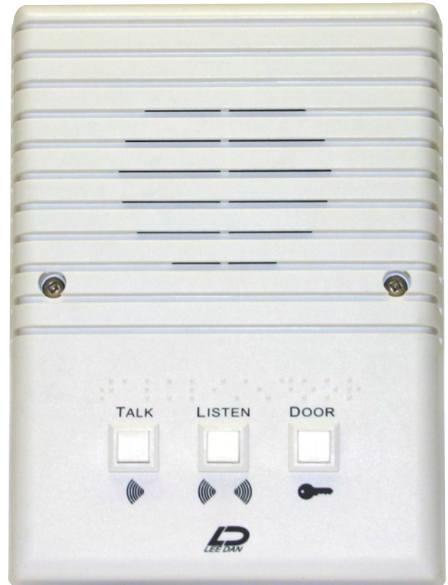
(shown smaller than actual size)

IR-105E 5 Wires. Use 2 twisted pairs, plus 1 selective #22 gauge.