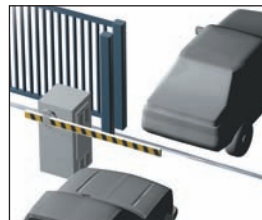
automatic sequencing when used in conjunction with slide or swing gate operators