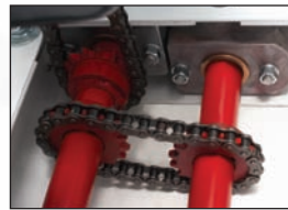
transfer box provides direct mechanical linkage between the barrier operator and spikes