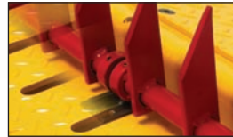
spikes available in 3 foot sections